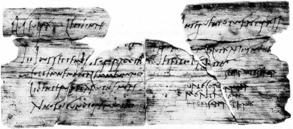
A Writing Tablet of Vindolanda